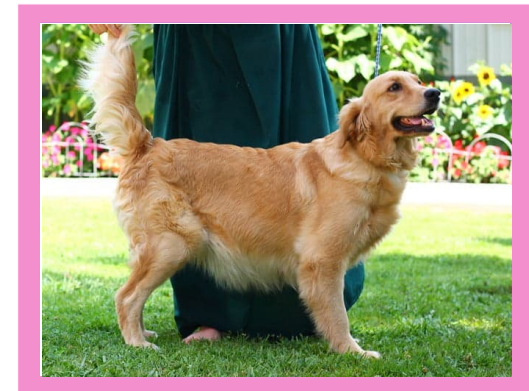
Greece (Golden Retriever)